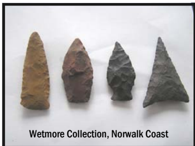
Wetmore Collection, Norwalk Coast