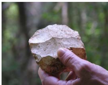
Clovis Hand Axe uncovered by the NCC Team

parting of the ice sheets and travel via the Bering Land Bridge. This theory has now been disproven, particularly in light of the 14,300 ybp coprolites (excrement) containing human DNA recently found in an eastern Oregon cave.