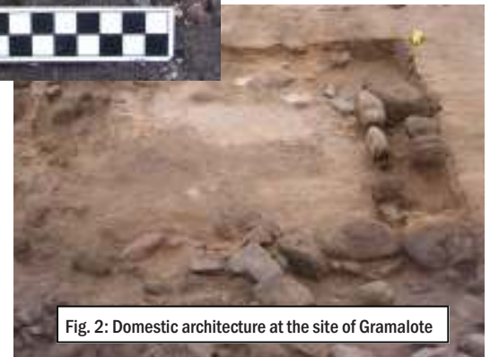
Fig. 2: Domestic architecture at the site of Gramalote