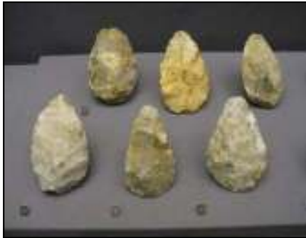
Acheulean Hand Axes, Musee de Picardy, Amiens, France. Near the St. Acheul neighborhood that gives the tool typology its name