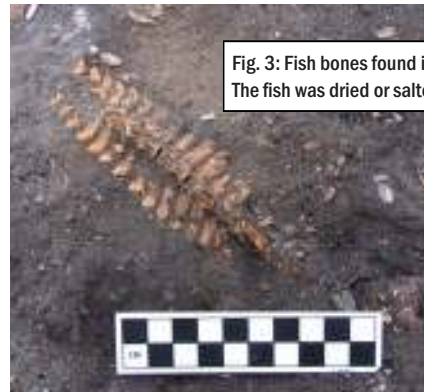
Fig. 3: Fish bones found in a feature of domestic architecture. The fish was dried or salted and bartered for inland products.