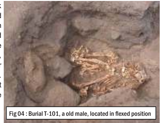
Fig 04 : Burial T-101, a old male, located in flexed position

Valley. His work has been published and presented in various reviews and congresses. Please join us Thursday, November 11th for his lecture. Refreshments at 7:30 pm and lecture at 8:00.