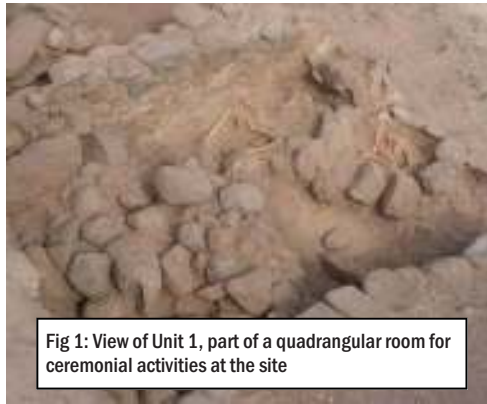
Fig 1: View of Unit 1, part of a quadrangular room for ceremonial activities at the site

Pampas Gramalote was a fishing village and my project is focused on understanding the social dynamic and the importance of early fishermen in the Central Andes. At the same time I am very interested in fishing technology and fish production.